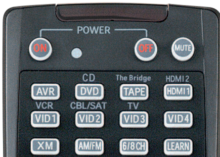
Figure 4 – Learning Remote Commands