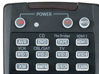
Figure 2 – Input Selectors

d) HDMI 2 Source: Press and release the Input Selector once, quickly press the Input Selector again so that it turns green, then release it. Now press and hold the Input Selector until the Program Indicator flashes, then release it. Next press the Input Selector that corresponds to the device type you want to program into the HDMI 2 mode, i.e., DVD, VCR or CBL/SAT. Then follow the directions in Step 4.